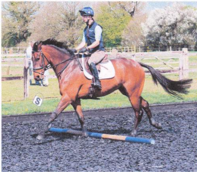
Canter over the first pole out of the same regular canter rhythm regardless of whether you are going to move or wait

horse (and rider!) will naturally knife in and cut across each corner. This exercise will aid straightness as you ride from point to point down the poles and will encourage the horse to stay straight through their body and work through their back. It will also help develop riding a correct and balanced turn. You can use subtle counter flexion on the straight lines to bring the horse onto two tracks in order to develop true straightness. By riding in from the track, you don't have the wall to balance so it encourages the rider to use their outside aids to keep the horse straight.