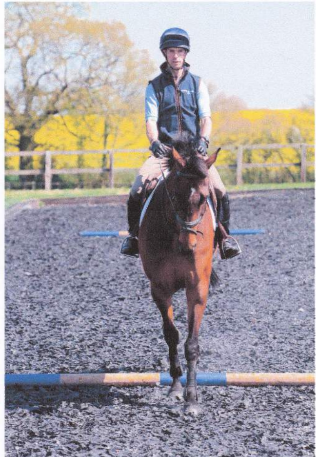
Support the horse with the outside aids as you come down the poles to keep them straight